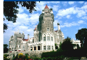
Magnificent Casa Loma Castle in Toronto