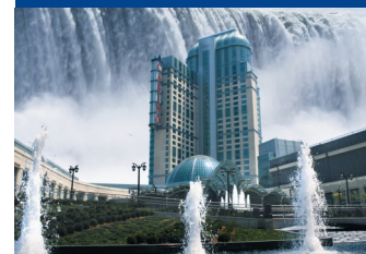
Gaming at Fallsview Casino