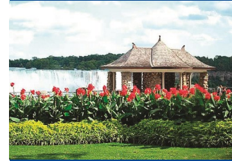
Visit beautiful Queen Victoria Park

Departure: Oceana County Council on Aging, 621 E Main St, Hart, MI @ 8 am, then Meijer Store, 5531 28th St. SE, Grand Rapids, MI @ 9:30 am